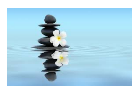
Reflections by Worship & Ministry (4/9/23) on Advices & Queries on Personal Relationships

We hope for and aspire to a home where spirit's presence is felt, love is love, and all are deeply welcoming to one another.